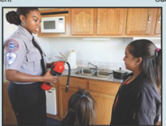
Teaching fire prevention and safety